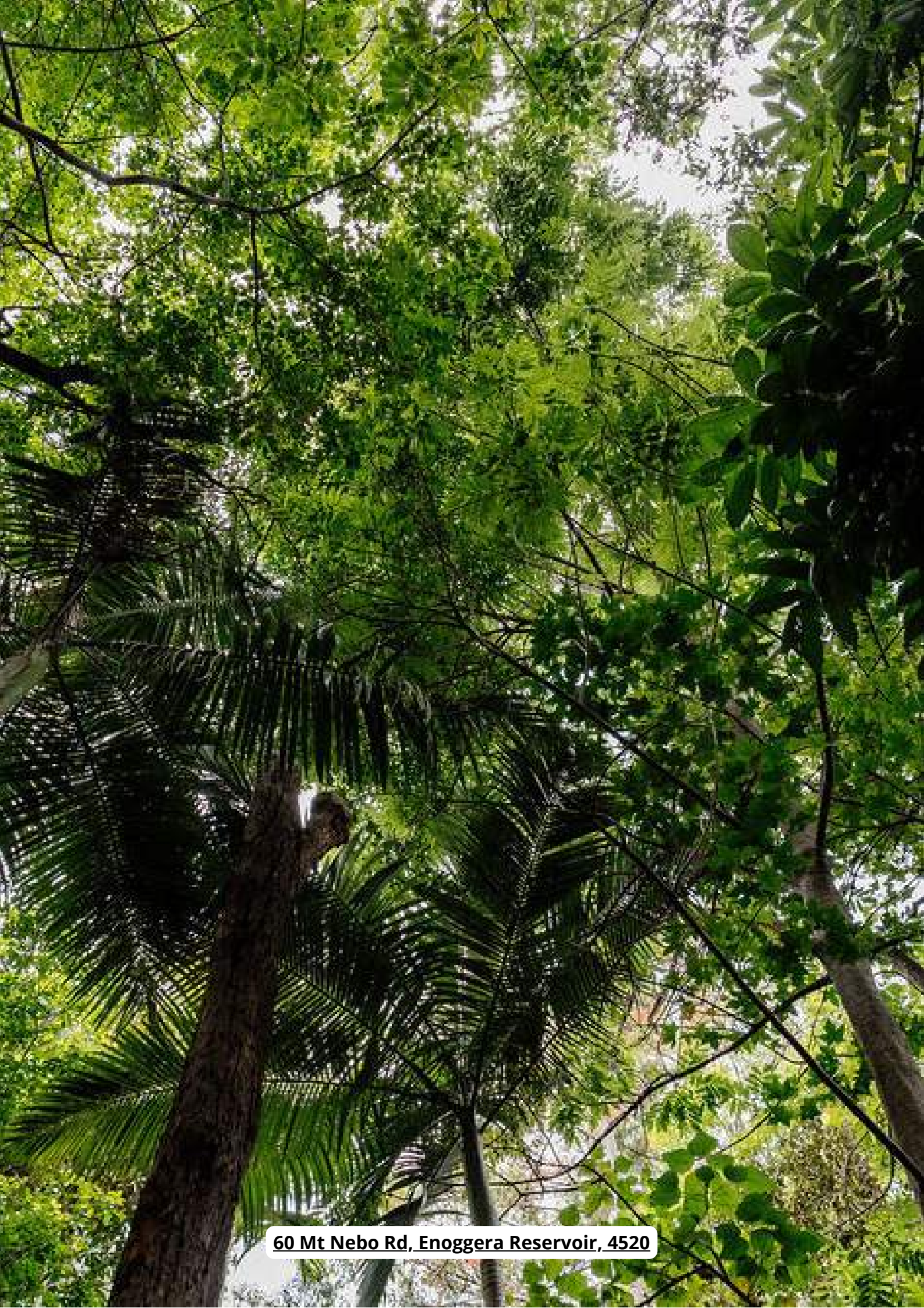
60 Mt Nebo Rd, Enoggera Reservoir, 4520