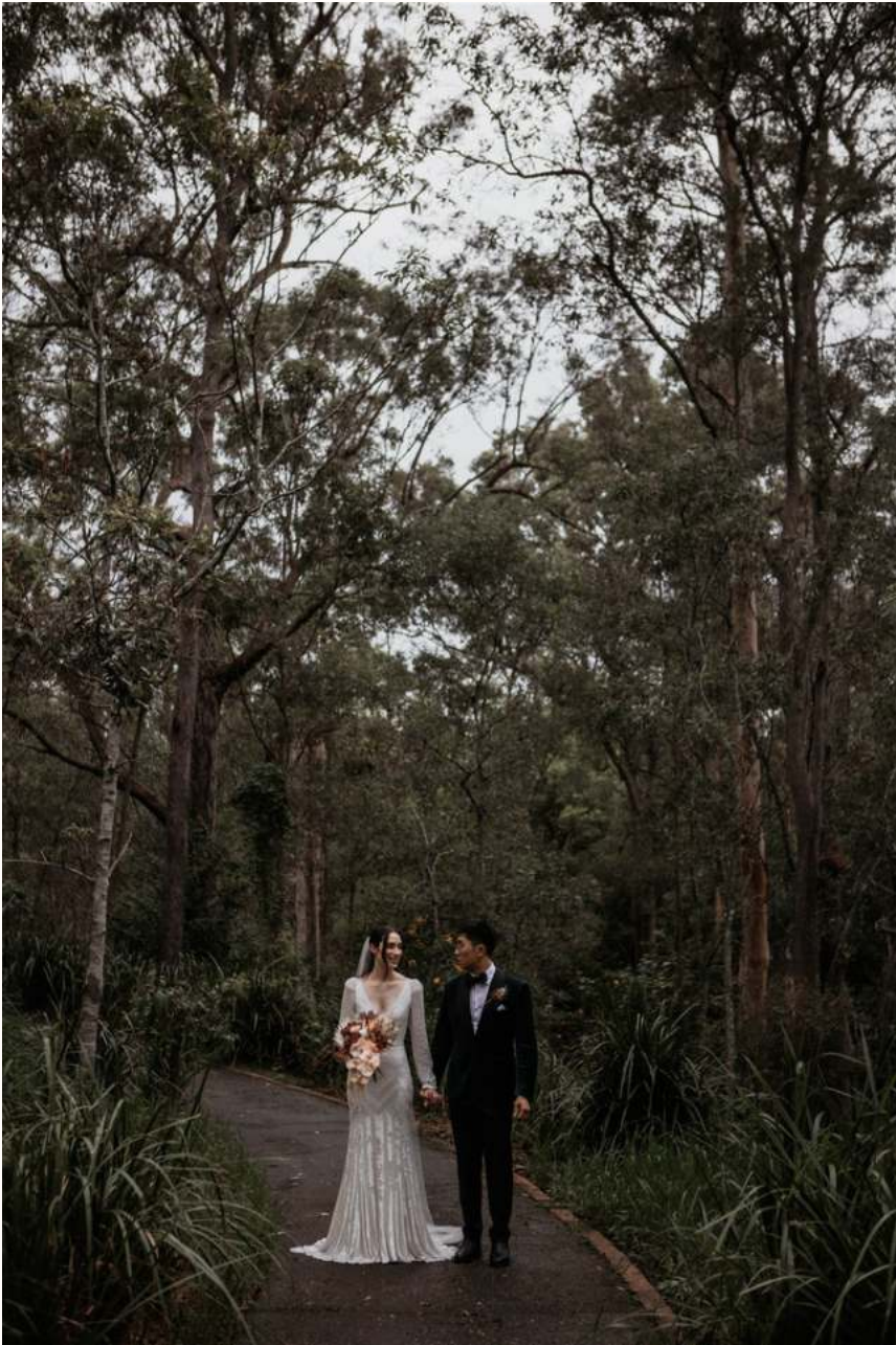
Cloud Catcher Studios