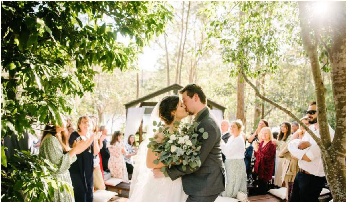
We Ae Twine Photography