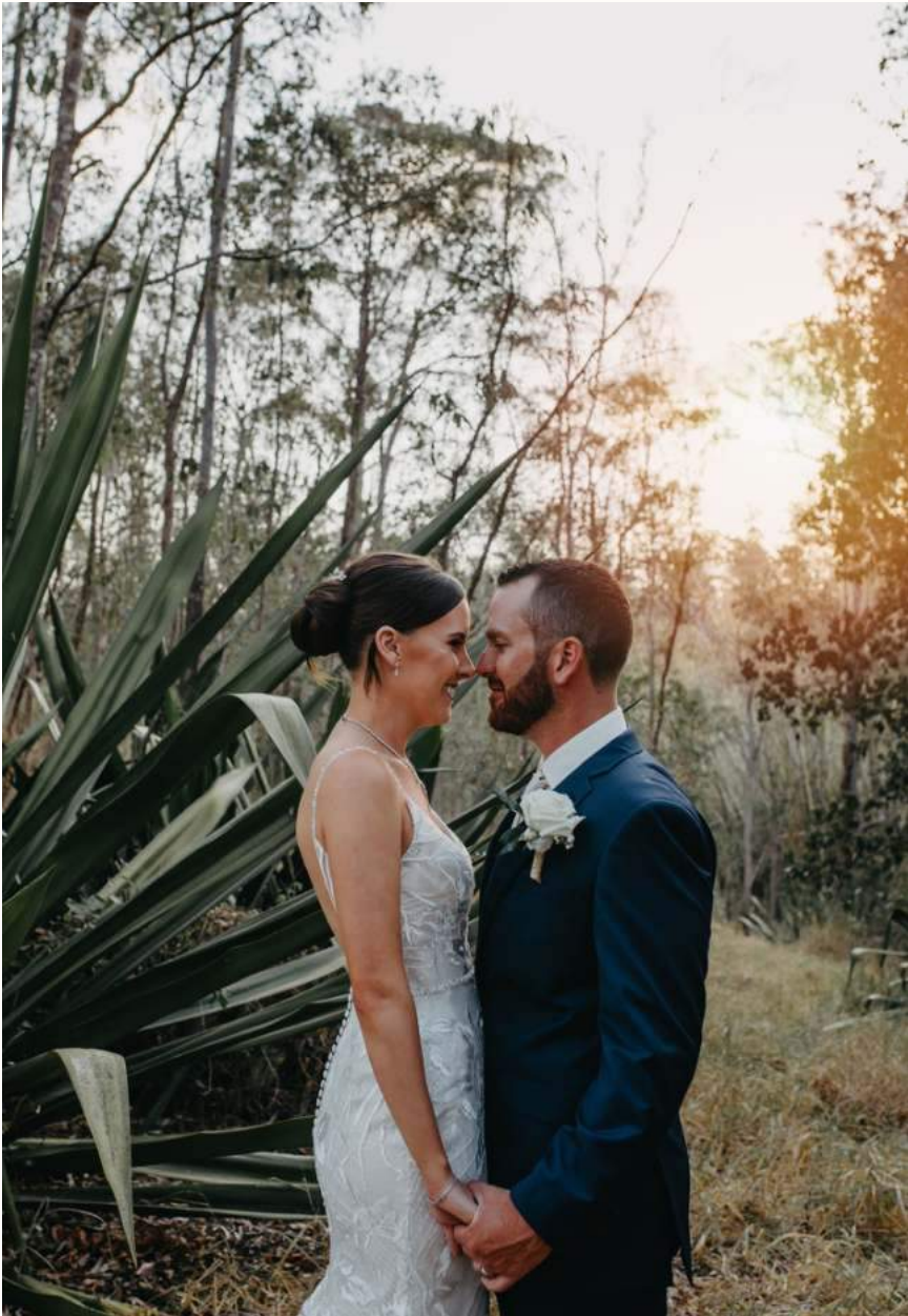
Black Palm Collective