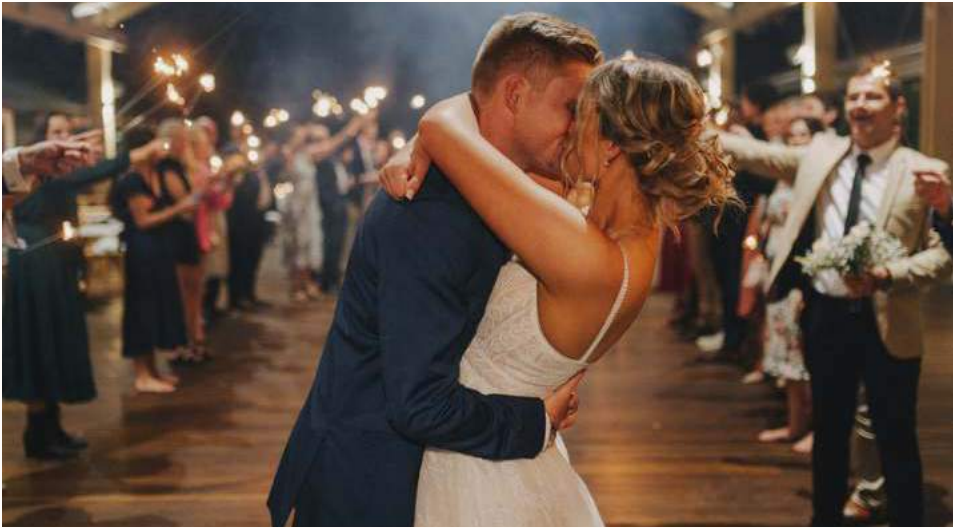
Foy & Co