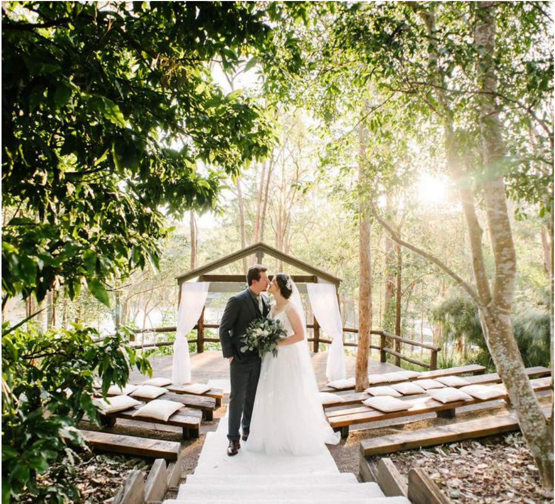
We Are Twine Photography

Would give 6 stars if it was possible! We got married in September, and we truly had the most perfect day; this certainly would not have possible without the Walkabout Creek team. Planning a wedding is supposed to be stressful but Jaya made the whole process a walk in the park! Communication was amazing from the very first day, and nothing was ever too much of a hassle. If you are looking to plan your perfect day, look no further!