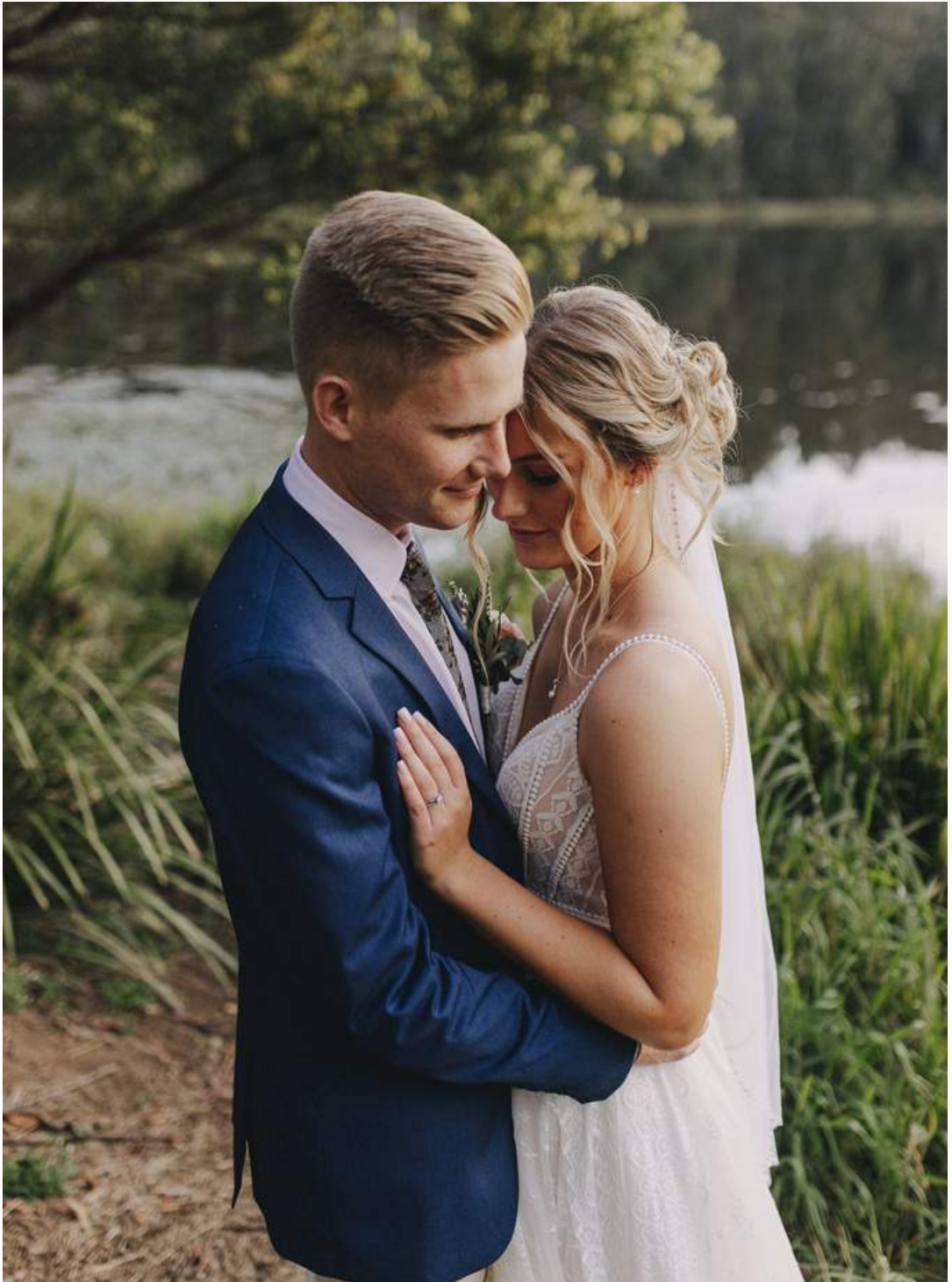
Foy & Co Photography