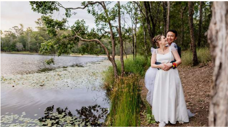
The Infinity Collective