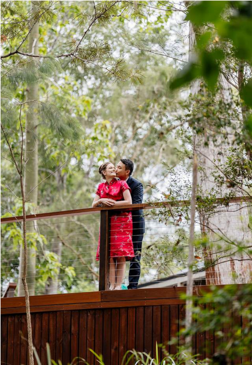
The Infinity Collective