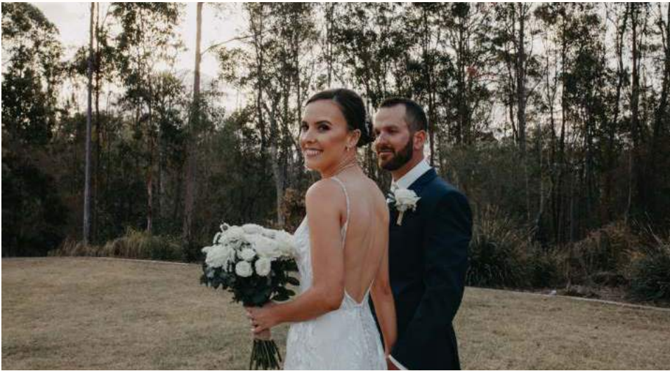
Black Palm Collective