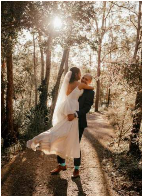
Angela Brushe Photography