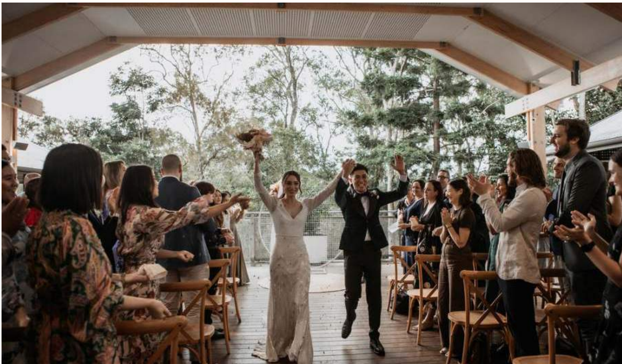
Cloud Catcher Studios