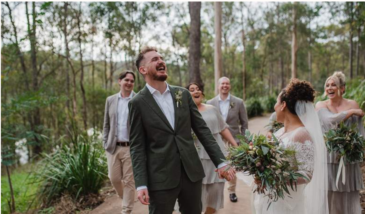
Graham Murray Photography