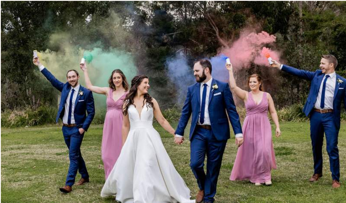
Nicole Laufer Photography