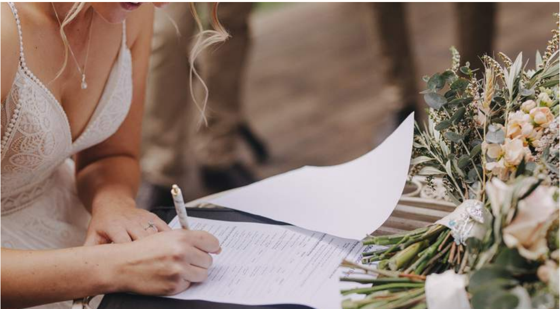
Foy & Co Photography