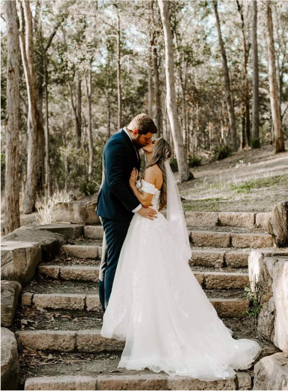
Wood & Willow Photography