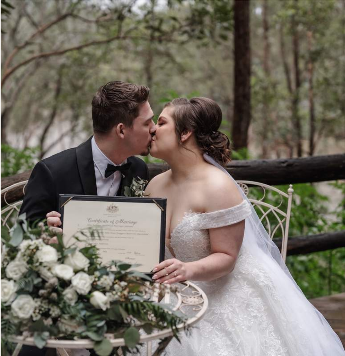
Dreamlife Brisbane Photography