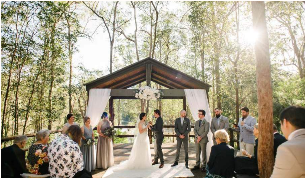
We Ae Twine Photography